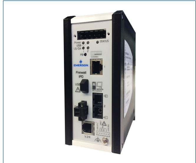
Figure 1 – The DeltaV™ Controller Firewall provides additional security protection for your DeltaV controllers.